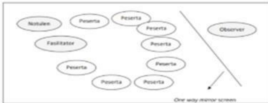
Figure 1. Design of FGD Member Positions

In order to get a more conducive situation in the Gender Responsive Budgeting (GRB) budgeting training for 9 representatives from all women parliamentarians of the Bali Provincial DPRD, we have determined the sitting positions as follows: